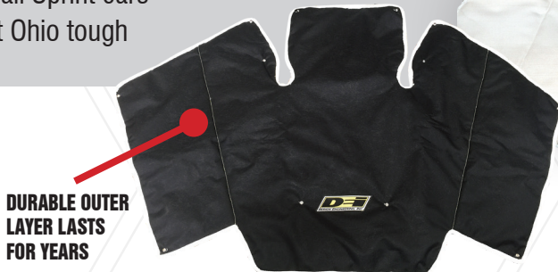
DURABLE OUTER LAYER LASTS FOR YEARS