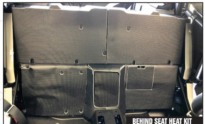
BEHIND SEAT HEAT KIT