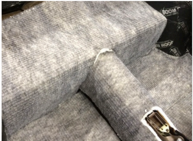
UC Lite installed with gray side up