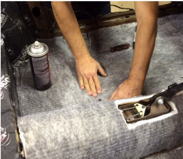
UC Lite trimmed & being applied with spray adhesive