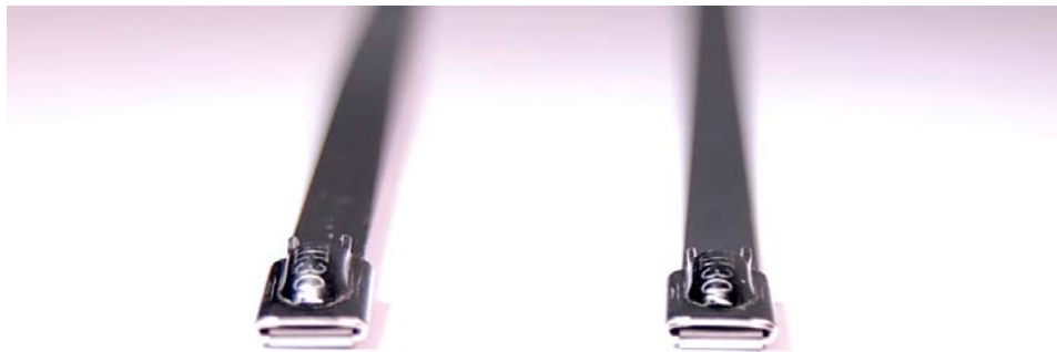
Fig. A (Buckle end of tie)