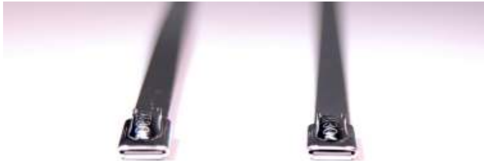
Fig. A (Buckle end of tie)